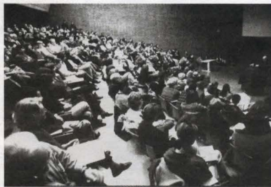
Standing room only at Exploring Word and Image Lecture series