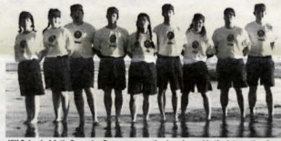
UW School of Art's Ceramics Program recently placed an ad in the international magazine "Ceramics, Art and Perception".

mfa clay at the university of washington vigorously dedicated to your individualism.