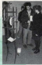
Wister Quarter Open 15, Jacob Lawrence Gallery