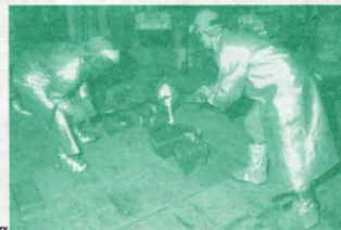
Iron pour at foundry